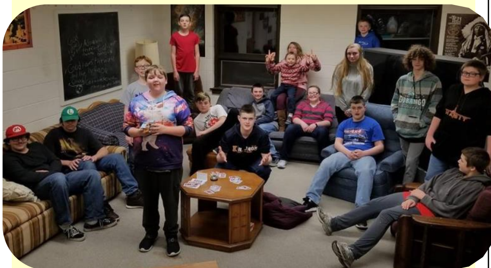
The Youth Group had a good time on February 10 for game night! The crew enjoyed dinner together before the fun.